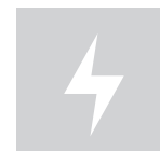
100-240 V AC