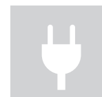
PLUG & PLAY